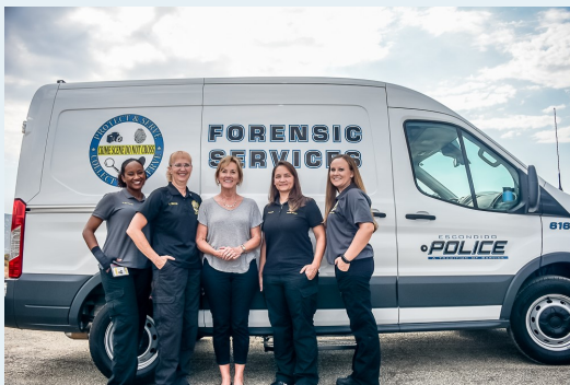
CRIME LAB TEAM

The Mission of the Civilian LE Symposium (C-LES) is to provide Leadership for the continued advancement of civilian training,